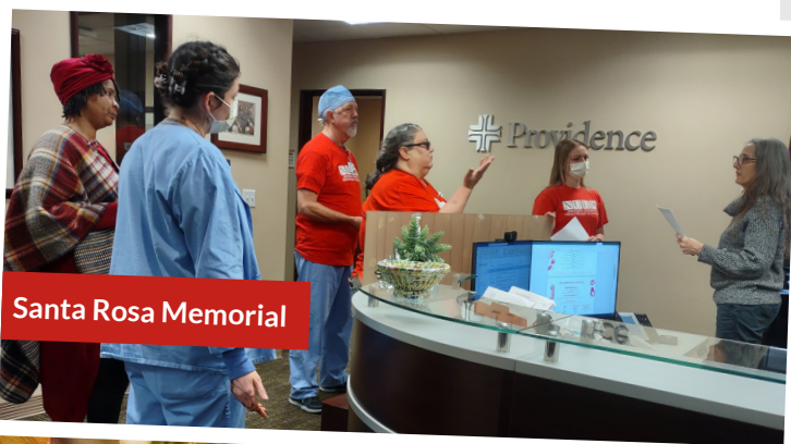
Santa Rosa Memorial

So far, Providence has refused to provide bargaining dates at all our hospitals. So we took this demand directly to them.