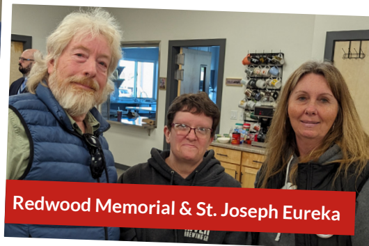
Redwood Memorial & St. Joseph Eureka