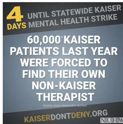
Post on Friday June, 7