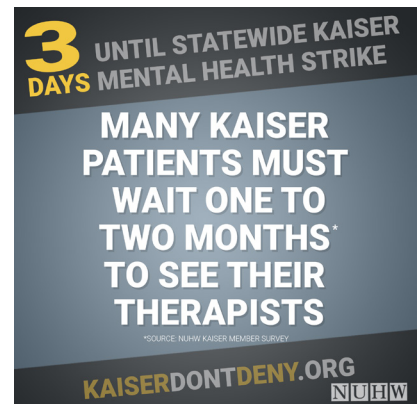
Post on Saturday, June 8