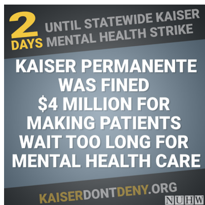
Post on Sunday, June 9