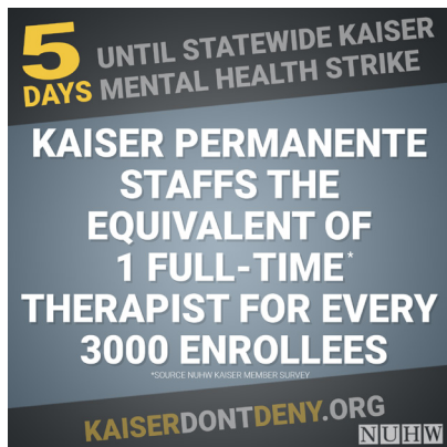
Post on Thursday June, 6

Post these memes in the days LEADING UP to the strike: