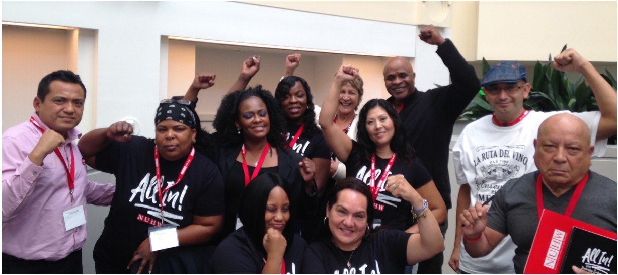
Leaders from Kindred hospitals in Brea, San Leandro and Westminster gathered at last month's NUHW Leadership Conference to discuss coordinating efforts to improve pay and staffing.