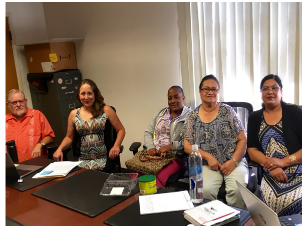
Kindred San Leandro's NUHW Bargaining Committee

They are fighting for improvements to patient safety, PTO, extra work system for per diems, just cause, labor management meetings, and protection if the hospital is sold.