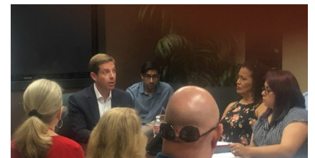
Kindred workers meet with Congressional candidate Mike Levin.

For more information on NUHW Endorsements go to http://nuhw.org/endorsements