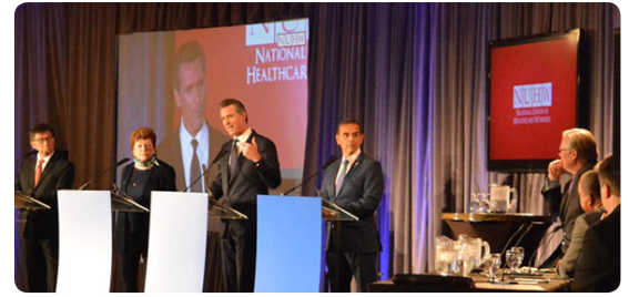
The four leading Democratic contenders debated at the NUHW-sponsored candidate forum in Anaheim.

Gold Star father Khzir Khan — who achieved national recognition last year when he pulled out a pocket constitution during a speech to the Democratic National Convention, while condemning Donald Trump's call to put a ban on Muslim immigration — delivered an emotional keynote address. "Your work is sacred work; You are the custodians of our nation's values," Mr. Khan told our leaders.